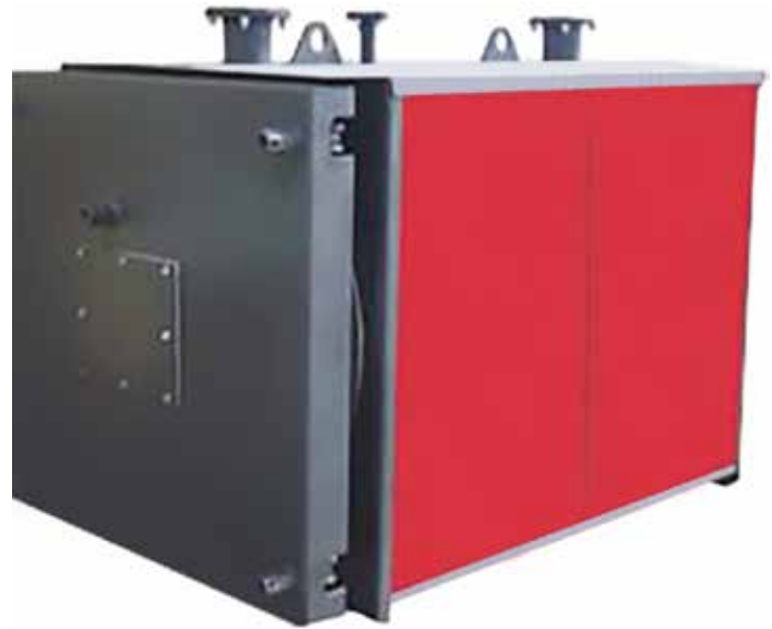
SFT FIRETUBE BOILER 150kW TO 1400kW