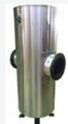
Air & Dirt Separator