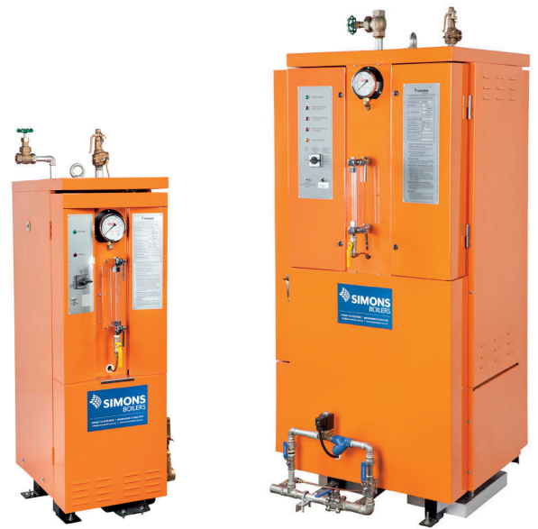
VS 300 SERIES 10 TO 80 KILOWATTS